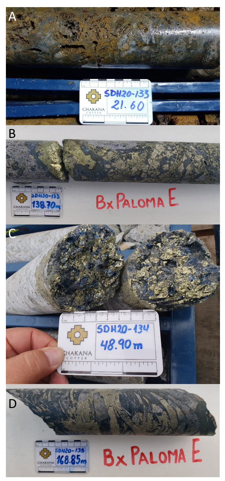
Figure 5 – Detailed core photos from Paloma East; A) SDH20-133, 21.6m, strongly oxidized gold-bearing tourmaline breccia; B) SDH20-133, 138.7m, mosaic breccia replaced by chalcopyrite-pyrite-tourmaline; C) SDH20-134, 48.9m, shingle breccia with band of massive chalcopyrite-covellite; D) SDH20-135, 168.85m, shingle breccia with tourmaline-replaced matrix and selective sulfide replacement of clasts.