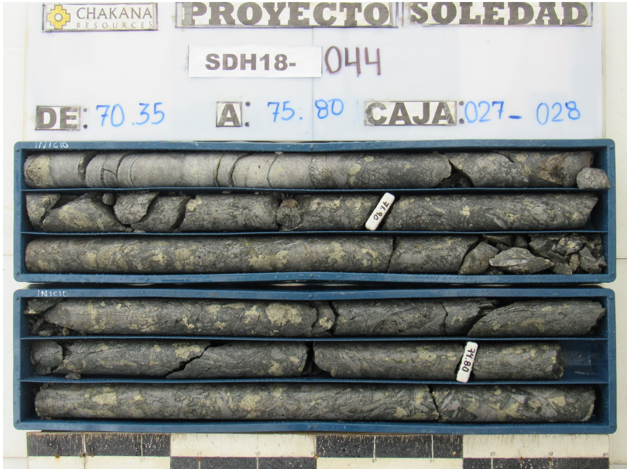
Figure 1 – High grade margin zone mineralization from hole SDG18-044 in Bx 1. The six metre interval from 70.0-76.0 averages 2.76% Cu, 8.33 g/t Au, and 19.6 g/t Ag.