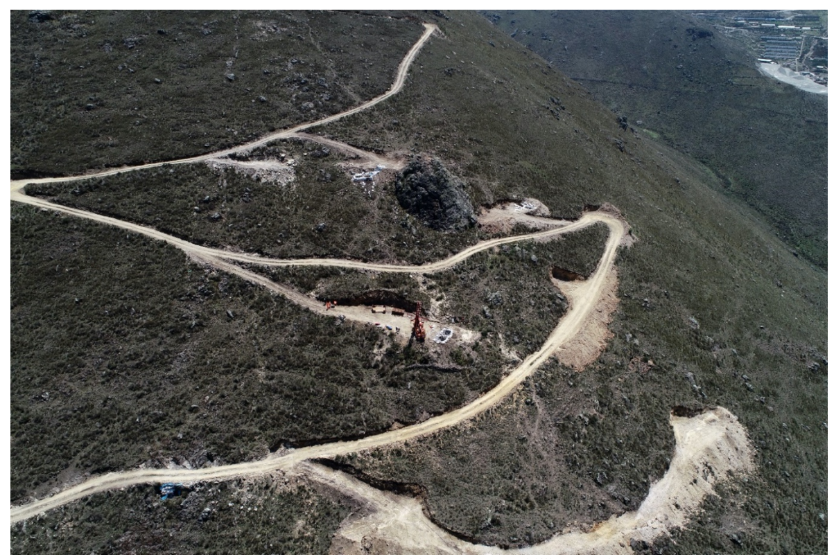
Figure 3 – Drone image looking east showing second drill rig initiating resource drilling at Paloma East (prominent outcrop in center of image). Note the Hercules mine in the upper right side of the image (1.5 km distant).