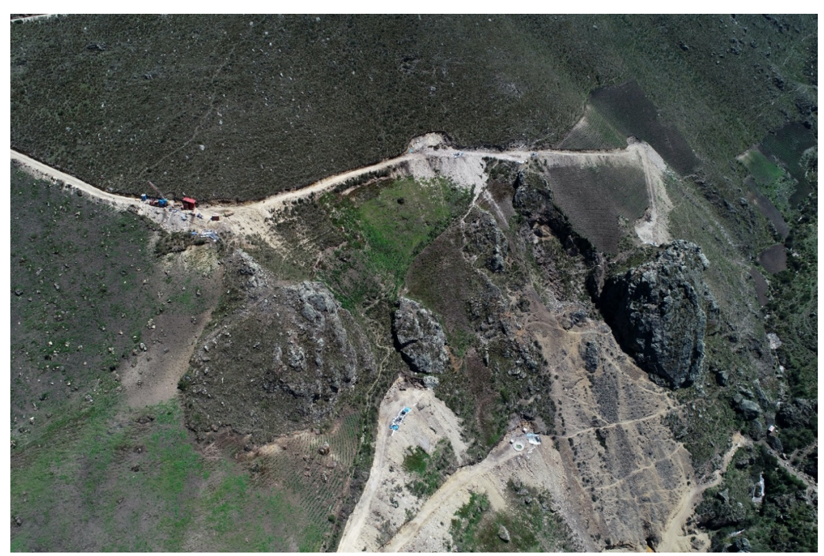
Figure 2 – Drone image looking north-northeast at the Huancarama Breccia Complex showing drill rig set up on the west side of the complex.